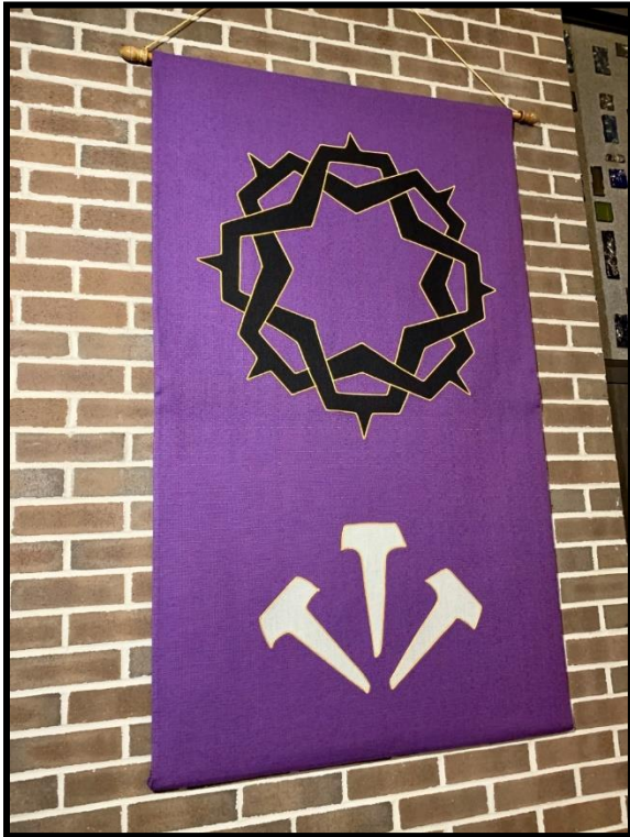
Our Lenten banner is purple in color and displays symbols of the crown of thorns and the nails used in Christ's crucifixion.

The English word "Lent" is a shortened form of the Old English word lencten , meaning "spring season." The pattern of fasting and praying for forty days is seen in the Bible, which is the basis for the liturgical season of Lent. In the Old Testament, Moses went into the mountains for forty days and forty nights