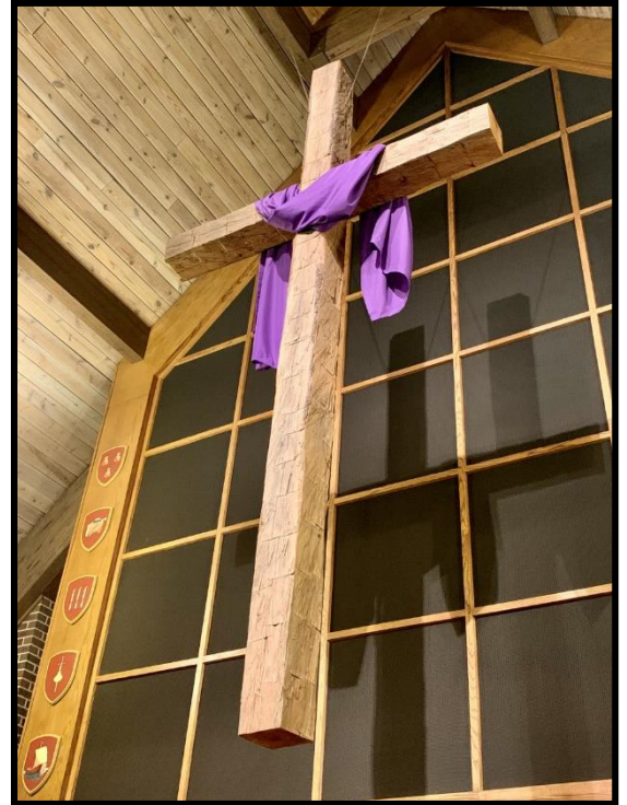
Our sanctuary cross veiled with a purple cloth in observance of Lent.