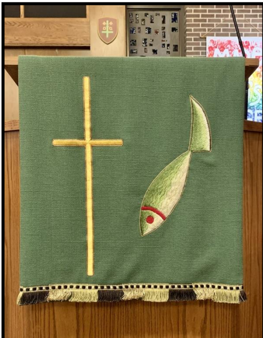
The green pulpit parament, featuring a cross and a fish.

Parament is the name for the pieces of cloth that adorn the pulpit, lectern, and altar table in our sanctuary. In many churches, including St. Paul's, the color of the paraments corresponds with the color of the liturgical season the church is celebrating. In our tradition, we recognize seven liturgical colors: violet, blue, white, green, red, black, and rose (pink). Green is the color for Ordinary Time.