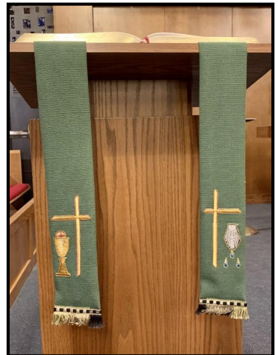
The green lectern paraments, featuring crosses, a chalice and wafer, and a seashell and water drops.

The green paraments on the lectern, where the lector reads from the Bible, are adorned with crosses, as well as a chalice and wafer, and a seashell and drops of water. These symbolize Holy Communion and Baptism, the two sacraments that we celebrate in the United Church of Christ.