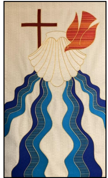
St. Paul's UCC's baptismal banner.

Naturally, water is a major symbol of baptism. The Holy Spirit, often represented as a descending dove, is also an essential element of baptism. Additionally, seashells (specifically scallops) are symbols of baptism. The symbol of the seashell has been associated with baptism since the first centuries CE; there are paintings on the walls of catacombs which depict people being baptized with water poured from a scallop shell. Because of its connection with baptism, the shell is also a symbol for John the Baptizer, as depicted in one of our faceted glass windows.