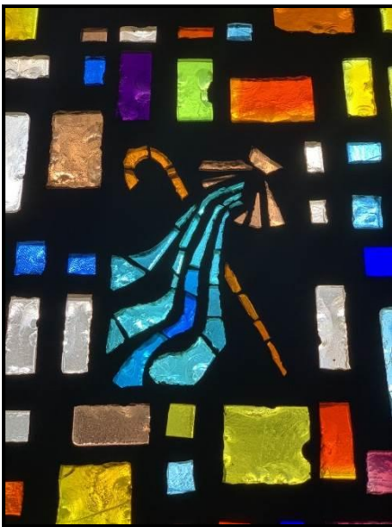
Faceted glass window symbolizing John the Baptizer: a figure depicted with a scallop shell as head covering, and water as a cloak.

A person is incorporated into the universal church, the Body of Christ, through the sacrament of baptism. In the United Church of Christ people are baptized either as babies, children, or adults. Baptism with water and the Holy Spirit is the mark of their acceptance into the care of Christ's church, and the beginning of new growth into full Christian faith and life.