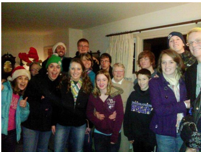
CHRISTMAS CAROLING 12/23/11

Every December the youth and young adults (and their dauntless adult drivers and chaperones) from St. Paul's take an evening out of their busy Christmas preparation and travel around town caroling for seniors and shut-ins from our church community. There is nothing quite like seeing the joy on a senior's face when they hear Christmas carols, a beautiful mix of childhood memories and holiday magic. It is a moment filled with many smiles and sometimes a few tears too. Although they don't necessarily know the people whose homes they visit, the youth are always willing to share an extra Christmas greeting or a warm hug. Many of the young adults who join in the caroling have expressed that this is one of their most treasured Christmastime traditions; an opportunity to spread Christmas cheer and share in fellowship with the youth, perhaps bringing back some childhood memories of their own. Oftentimes the young carolers are invited in for a warm drink or a Christmas cookie. The youths' only regret is that they can't visit everyone's home. Afterward, the chilled and chapped carolers are invited to Gene and Martha Keith's home where they can warm up and un-wind around an open fire, grilling hot dogs, toasting marshmallows, and sharing in laughter and fun. Christmas caroling is a St. Paul's Youth tradition that we hope will continue for many years to come – Allyssa Boyer.