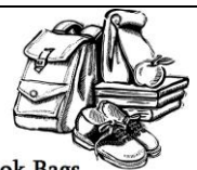
Blessing of Book Bags

MARK THIS DATE ON YOUR CALENDAR NOW! Join us on Sunday, August 28th as we prepare for a new school year and bid summer a fond farewell. Bring your book bags, backpacks and briefcases to worship for a special back-to-school blessing during the children's sermon. After the service, come to Fellowship Hall for an Ice Cream Social. Ice cream before lunch? Hey, it's only once a year! Please keep an eye out for this event in the August Worship Bulletins.