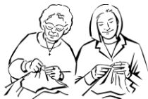
St. Paul's Prayer Shawl Ministry