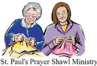
St. Paul's Prayer Shawl Ministry