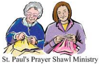
St. Paul's Prayer Shawl Ministry

CALLED TO CARE TEAM MEETING (Youth Room 7/8) – Sunday June 10 th following the Blessing of the Garden.